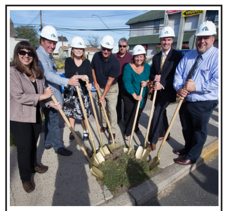
The Streetscape Phase I , ground-breaking took place on September 24th and construction began September 28th. (NJEDA Grant Award $1.5M)

HBP contributed to small business inquiries and provides assistance to existing businesses. HBP helped businesses with problems that impact their businesses as well as met with potential investors to tour the town and vacant parcels.